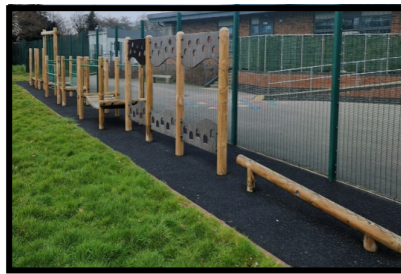
Outdoor trim trail